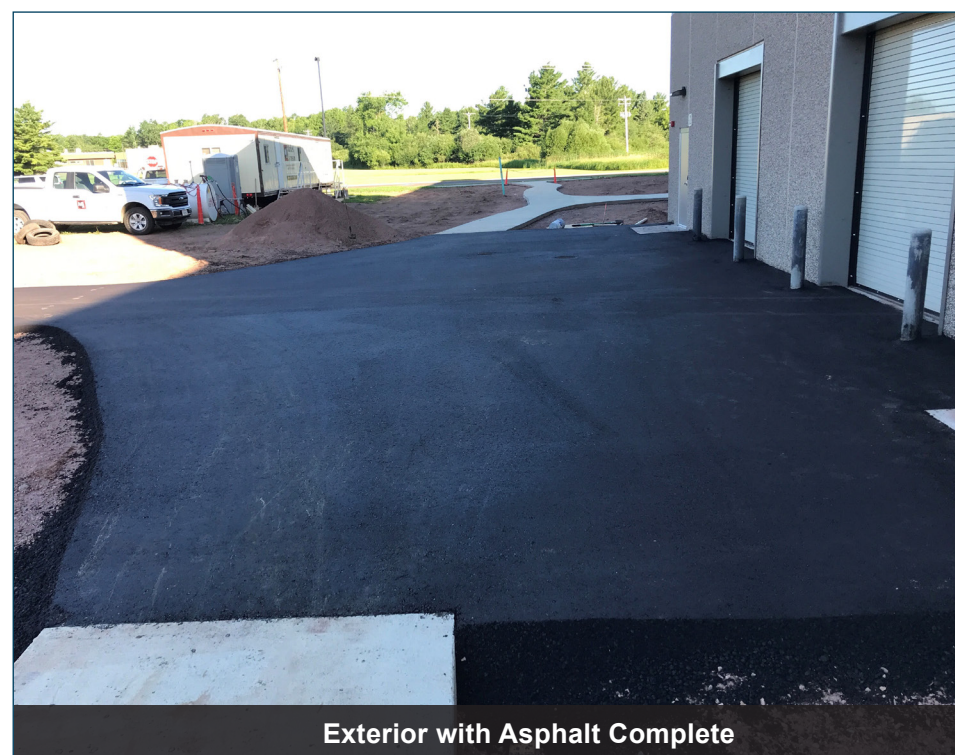
Exterior with Asphalt Complete